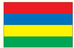
The National Flag