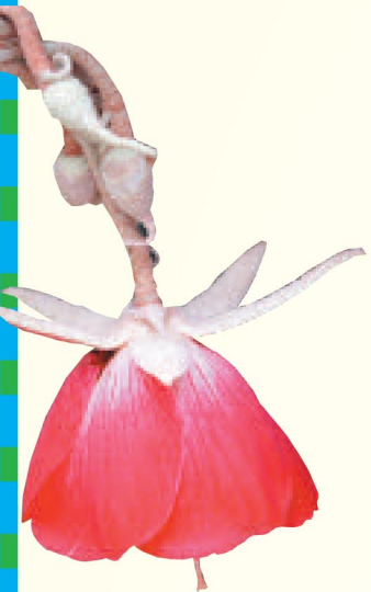
Trochetia Boutoniana, the National Flower